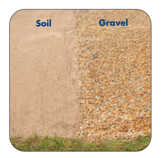
For further information on GroundGuard, please visit our website: www.floplast.co.uk